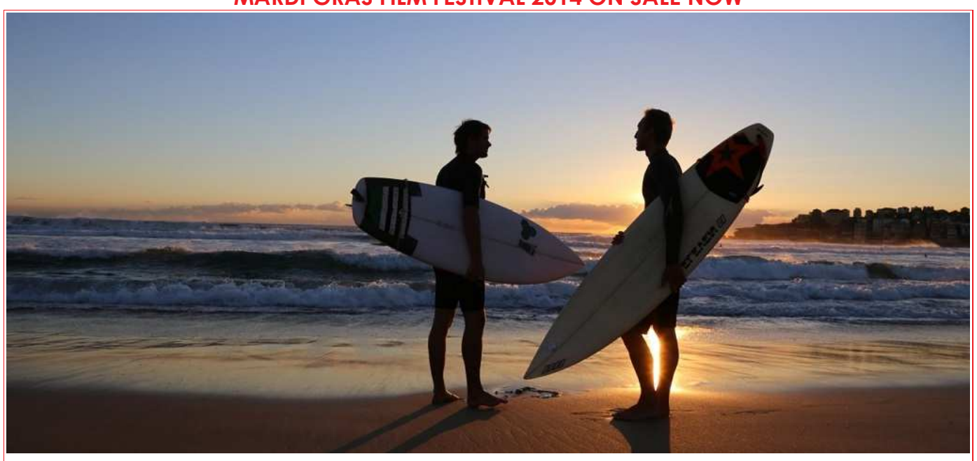
Mardi Gras Film Festival February 13 - 23

Mardi Gras Film Festival is turning 21 and to celebrate we've arranged eleven days of great films and parties in our new home at Event Cinemas George Street. Check out our great <u>selection of films</u> available now, and don't forget the <u>Festival Bar line-up</u>. Our program guide is also in this week's Sydney Star Observer so remember to pick up a copy.