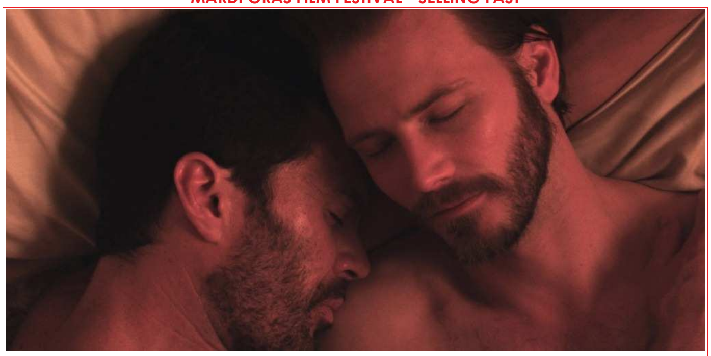
Mardi Gras Film Festival February 13 - 23

We're very excited that our Opening Night film REACHING FOR THE MOON has now sold out. We're also excited to announce an encore screening of this great film on <u>Thursday 13 February at 7.30pm</u>. This session does not include an after party, and tickets are regular MGFF prices.