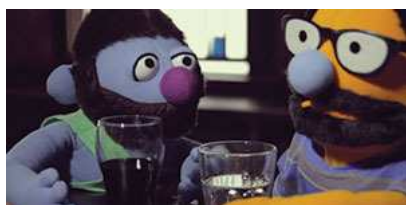
BEST OF GOLDEN WOOFs Sunday 23 Feb | 1pm

This film offers a beautiful glimpse at love, loneliness and transgendered life in Pakistan through the eyes of Noor, a man simply looking for acceptance. BUY TICKETS