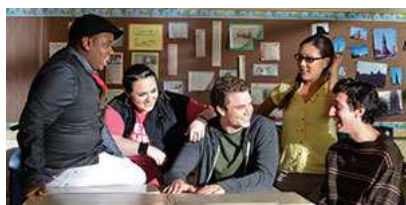
GEOGRAPHY CLUB Saturday 22 Feb | 1pm