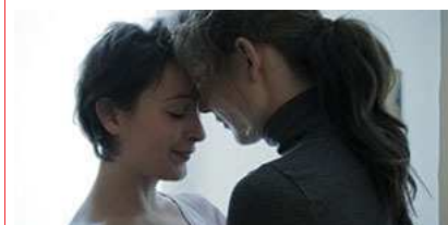
TWO MOTHERS Friday 21 Feb | 7pm

The festival is heating up and there's some unmissable films screening in the coming days. Make sure you're in the audience for these stand out selections that traverse everything in cinema from documentary to drama, comedy and music.