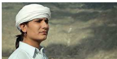
NOOR Saturday 22 Feb | 9.30pm

An unsettling but poignant depiction of the underground gay and lesbian community in the West African country of Cameroon. BUY TICKETS