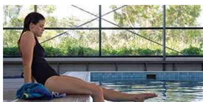
SUBMERGE Saturday 22 Feb | 7pm

An illuminating doco of the historic 1973 tennis match between Billie Jean King and self-proclaimed "male chauvinist pig," men's champion Bobby Riggs. BUY TICKETS