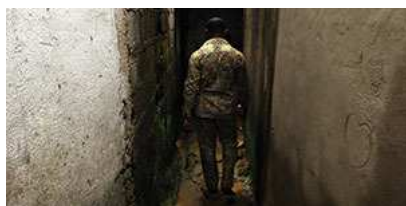
BORN THIS WAY Saturday 22 Feb | 6.30pm

Jordan is under work, study and family pressure. When she meets Angie, she escapes into a world of Melbourne's fetish clubs, partying, anonymous sex and drug taking. BUY TICKETS