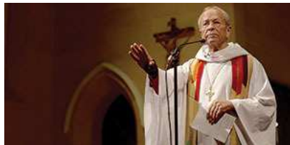
VICKY - THE GAY GENE COMES TO AUSTRALIA Sunday 23 Feb | 3pm

Short films featuring cute cubs, hot daddies, sexy otters, cheeky chubs, friendly chasers and infamous scruppets. BUY TICKETS