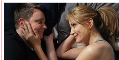
HETEROSEXUAL JILL Friday 21 Feb | 9.30pm

When Katja and Isabella, happily married, decide to have a child, they are confronted with unexpected obstacles... and by each other. Screened at the Berlin Film Festival. BUY TICKETS