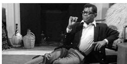
PORTRAIT OF JASON Saturday 22 Feb | 4pm