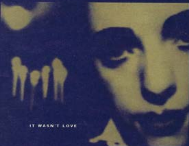
IT WASN'T LOVE